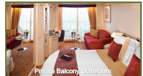
Private Balcony Stateroom